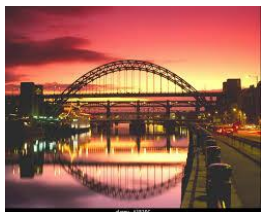
Curriculum Grid Summer 1 2026 'Growing'